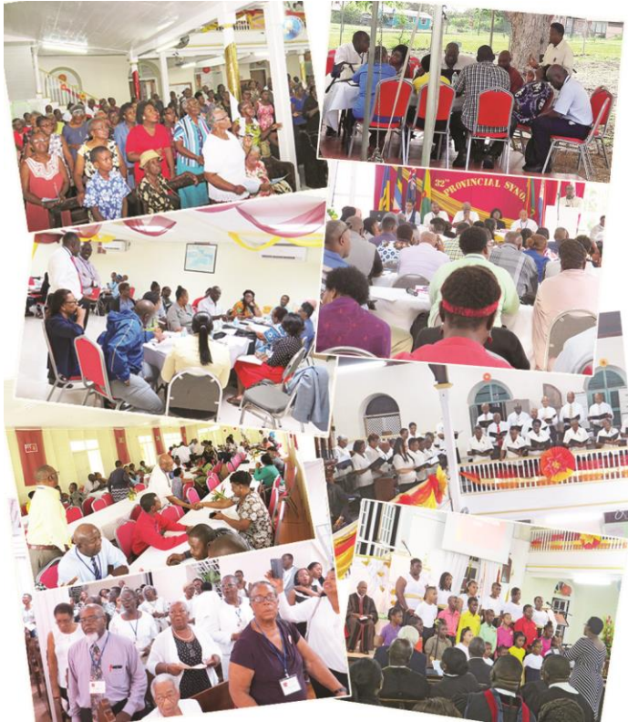
The collage above captures Delegates, Observers, Choirs performing, the Congregation at the Opening and Closing Services, Synod in Session and at lunch.

The 32 nd Provincial Synod of the Moravian Church – Eastern West Indies Province, met at the Duncan C. Moore Centre at Sharon, St. Thomas in Barbados from July 15 to 19, 2019. Synodals were accommodated at the Halcyon Palm Hotel, and Travellers Palm Apartments in Sunset Crest, St. James, and Sunbay Hotel on Maxwell Coast Road, in Christ Church. The Opening Service was held at Calvary in Roebuck Street, and the Closing Service of Holy Communion at Sharon in St. Thomas. A total of seventy-two (72) Delegates and thirty (30) Observers attended.